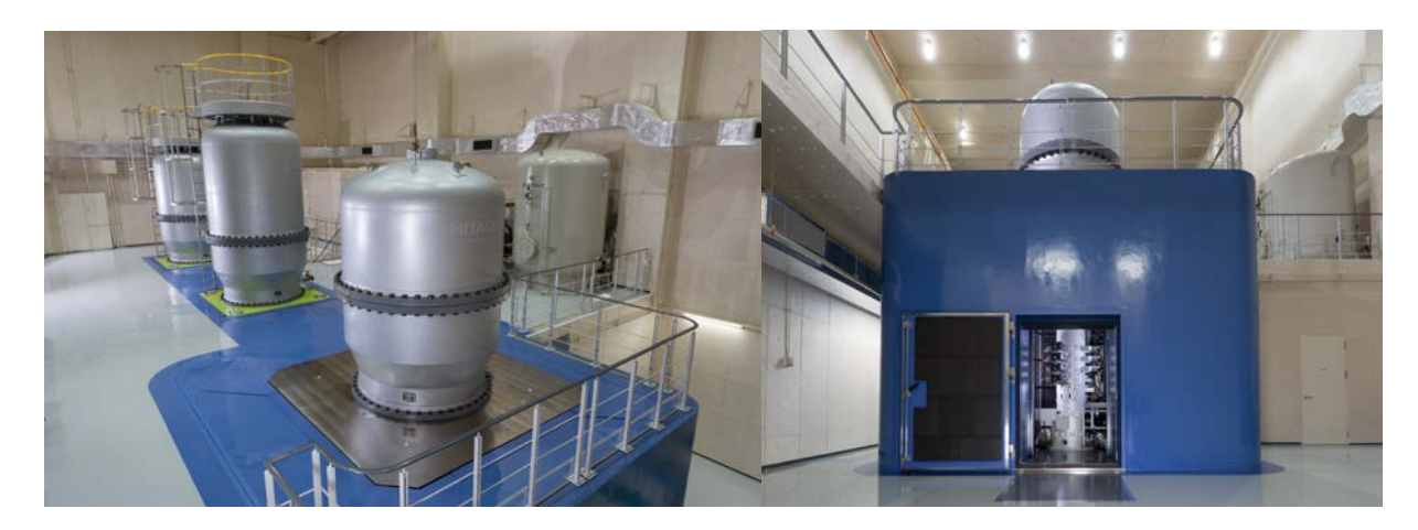
Figure 1. Aberration corrected 1.2-MV cold field-emission transmission electron microscope.

[5] This research was supported by a grant from the Japan Society for the Promotion of Science (JSPS) through the Funding Program for World-Leading Innovative R&D on Science and Technology (FIRST Program)," initiated by the Council for Science and Technology Policy (CSTP).