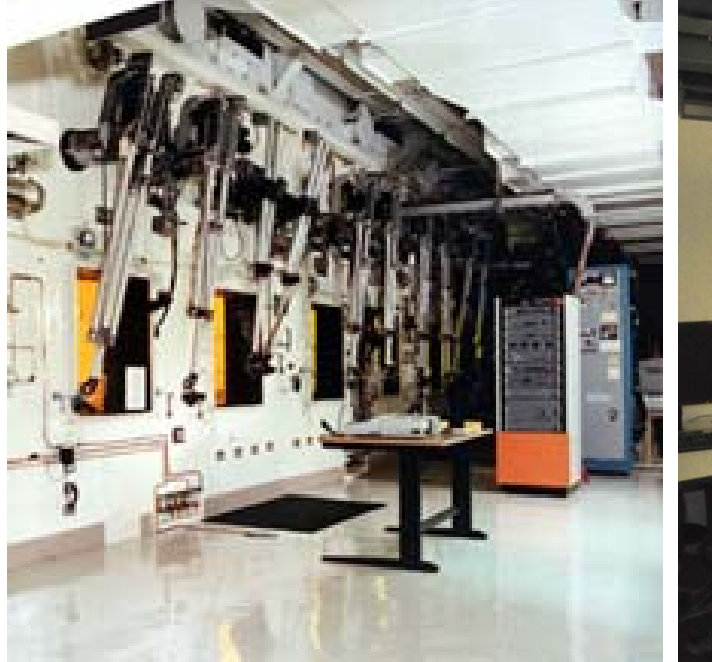
Figure 1: Irradiated Materials Examination and Testing (IMET) hot cell facility.