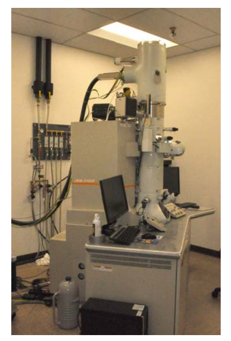
Figure 3: JEOL 2100F TEM/STEM instrument. Equipped with EDS and EELS+EFTEM, this tool is now available for irradiated materials and fuels work in LAMDA.