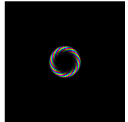
Figure 1: Simulated phase and intensity of +10\hbar vortex subject to the OAM-dependent lens term with b=3 um, B_0 = 0.01 T, R = 10 um, and beam energy E = 100 keV.

[10] V. Grillo et al., New Journal Phys 15 (2013) 093026.