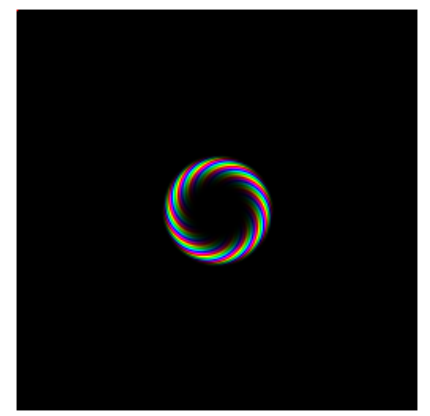
Figure 2: Simulated phase and intensity of -10ħ vortex under the same conditions.