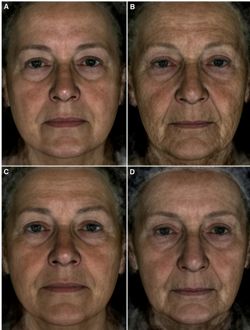
Figure 1. Illustration of the Effect of Wrinkling and Non-wrinkling Components on Perceived Facial Age

(A–D) Facial averages of Dutch European women who looked young or old for their chronological age without (A and B) and with (C and D) adjustment for the effect of wrinkles. Enface average image of 22 women (mean chronological age 70) who looked young for their chronological age (mean perceived age 59) (A) and 22 women (mean chronological age 70) who look old for their chronological age (mean perceived age 80) (B); differences in face shape changes (e.g., lip size, jawline sag, nasolabial fold) and wrinkles (average percent of skin covered by wrinkles was 2% for A and 10% for B) are evident. Enface average image of 20 women (mean chronological age 69) who looked young for their chronological age (average perceived age after adjusting for wrinkles was 60) (C) and 20 women (mean chronological age 69) who looked old for their chronological age (mean perceived age after adjusting for wrinkles was 78) (D); differences in face shape changes and skin color are evident. The mean total skin area covered by wrinkles for (C) and (D) was the same (5%). See Figure S1 for correlations of perceived age with chronological age and age-related sub-phenotypes such as wrinkles and pigmented spots in the Rotterdam Study discovery cohort. See also Table S3 .