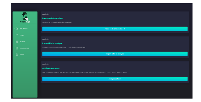
Figure 2: SmartBugs Web Dashboard

This command creates an output folder with the results of the analysis for each tool executed. By inspecting the output files, we can determine very quickly which contracts are identified as having vulnerabilities. Since all the tools added to SmartBugs come with a parser mechanism to normalize the output, a json file, with all vulnerabilities detected by the tool is created. A file containing the raw output of the tool executed is also generated in the same folder. Also, the SmartBugs logs are stored in a folder called logs composed of files named with the date and hour of the execution.